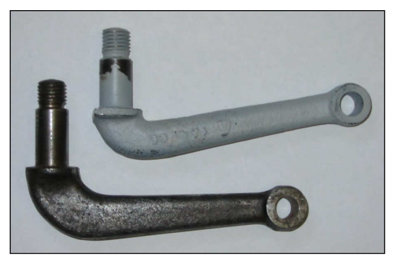
Standard Austin 7 arm (top) compared with Big 7 arm

Looking at the various arms produced by Austin over the years showed that there had not been any significant redesign until the Big Seven came along. This arm is much heavier and the radius of the bend is not so severe, but there are several other differences: it has no flat on the flange, there is a keyway on the shaft, and the arm does not curve back as far as the earlier type. However, to my knowledge, none of this type has ever been known to fail, so it was decided to use this arm as the basis for the new ones. It seemed justifiable, in this case, to break from usual practice and make these parts to a later design.