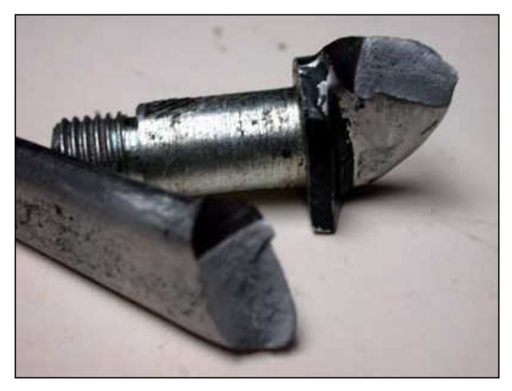
Broken steering arm