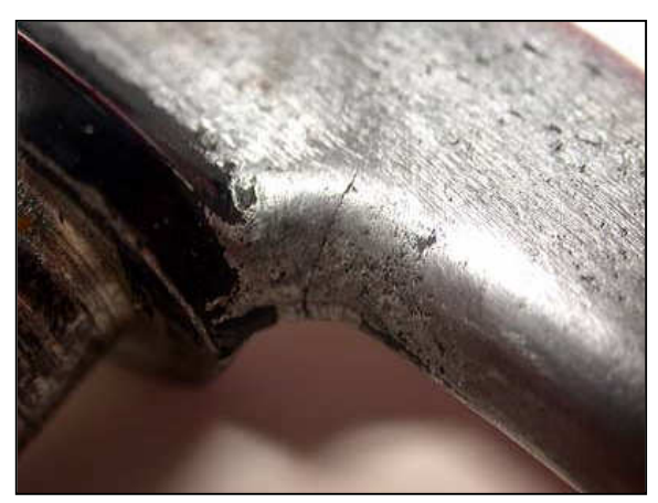
Cracked steering arm